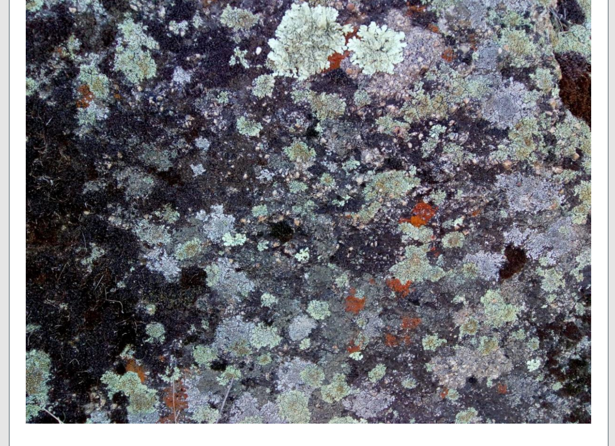
Article and photo by Diane Kennedy